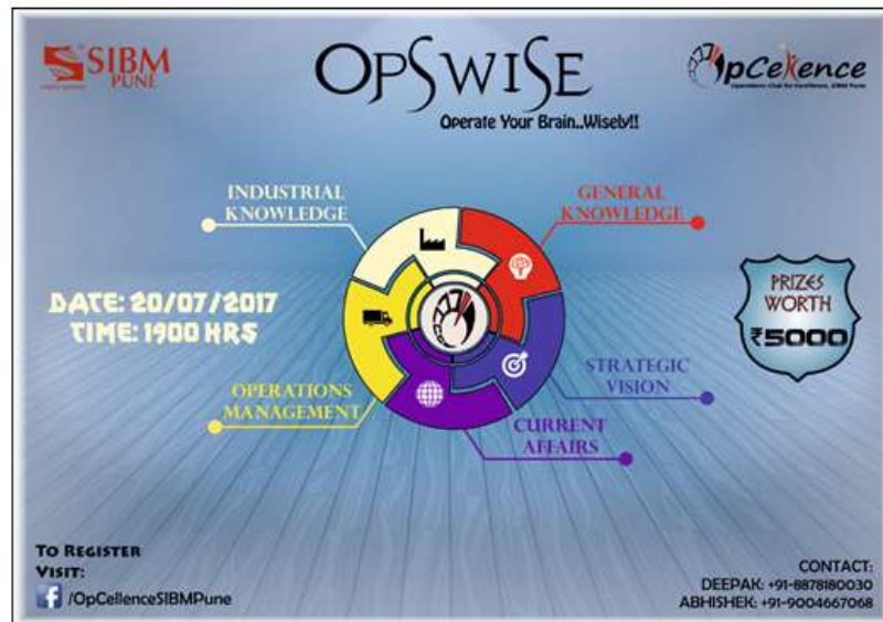
Fig 1 : Launch poster for the event

OpsWise, an online quiz competition targeted towards MBA pursuant in various colleges was