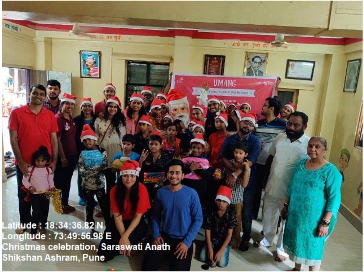
Photo1: Christmas Celebration 25 December 2019-20