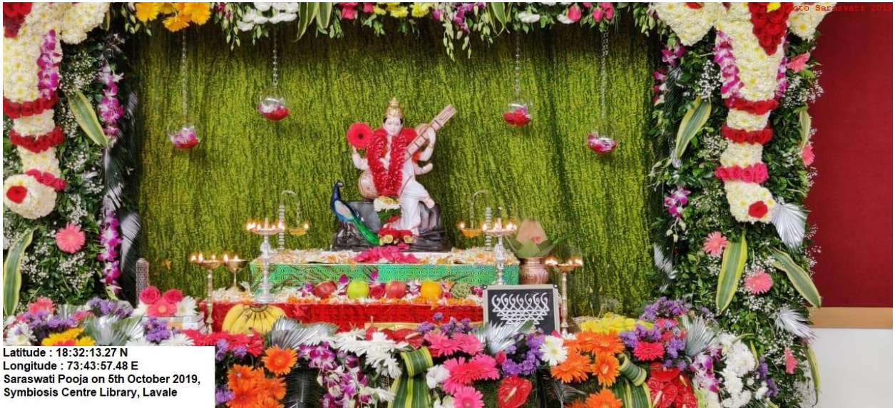
Photo: Saraswati Pooja 5 th October 2019