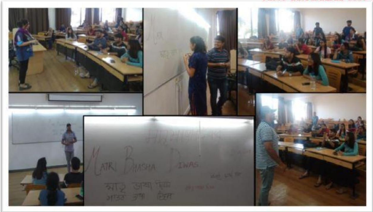
Photo Matribhasha 2018-19