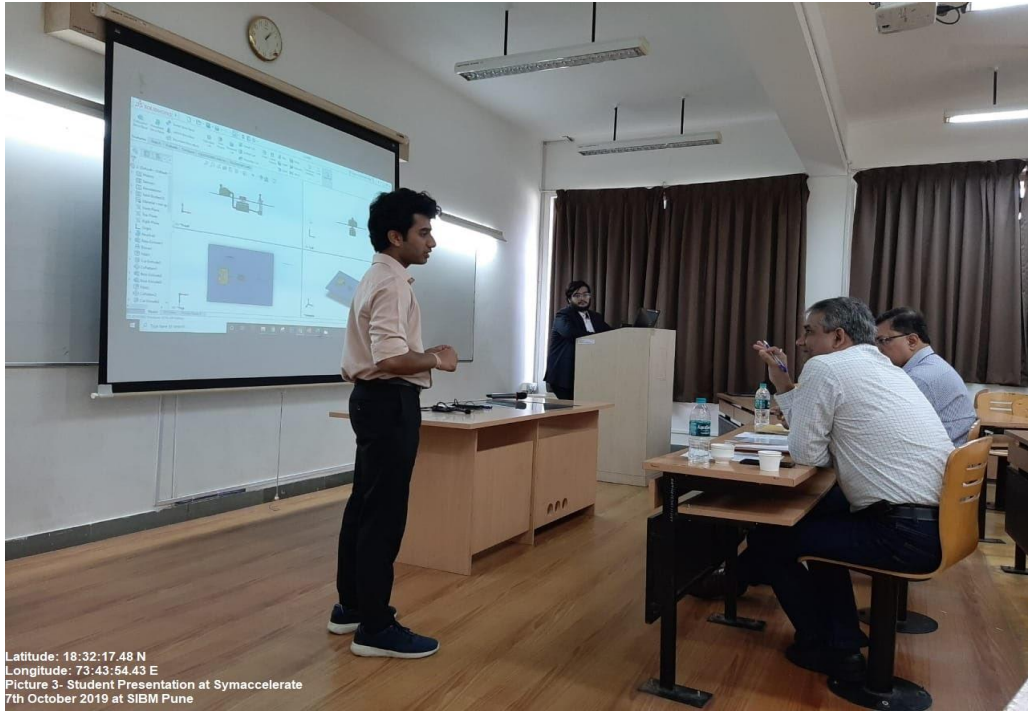
Latitude: 18:32:17.48 N Longitude: 73:43:54.43 E Picture 3- Student Presentation at Symaccelerate 7th October 2019 at SIBM Pune