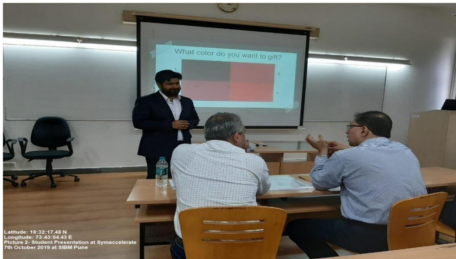
Picture 2-Student Presentation at Symaccelerate