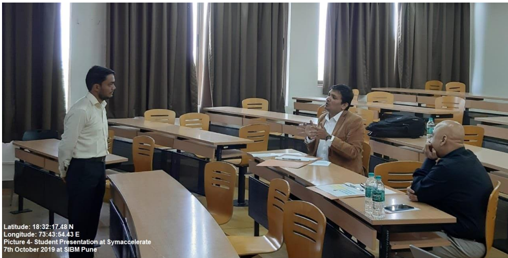
Latitude: 18:32:17.48 N Longitude: 73:43:54.43 E Picture 4- Student Presentation at Symaccelerate 7th October 2019 at SIBM Pune