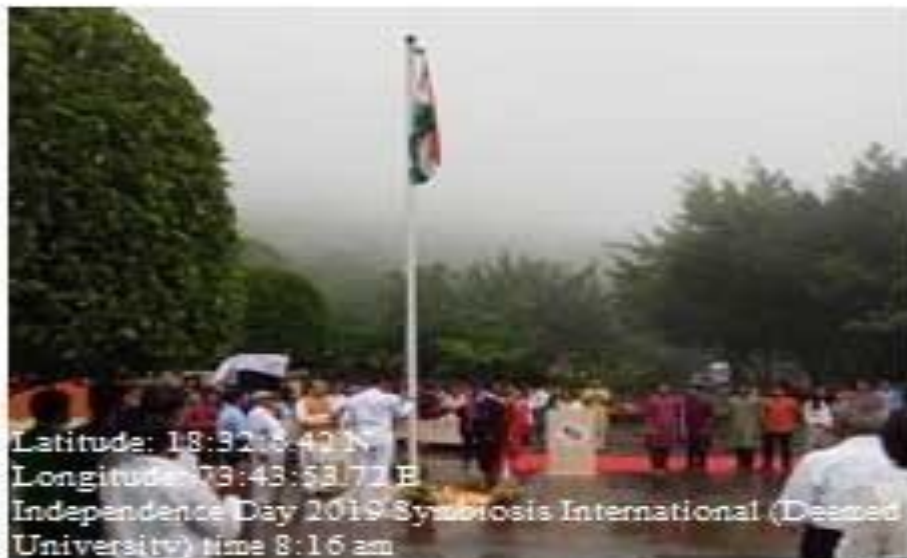
Independence Day- 2019-Picture1

In her speech she mentioned that Independence day is a day to rejoice, celebrate our political freedom and remember the great freedom fighters who struggled, so that we may enjoy the fruits of freedom. A cultural program was organized by the students of Symbiosis Institute of Business Management Pune.