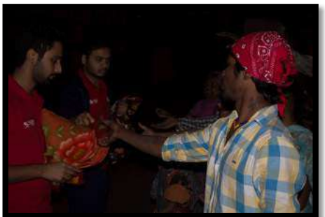
Blanket distribution during “Winter is Coming.”