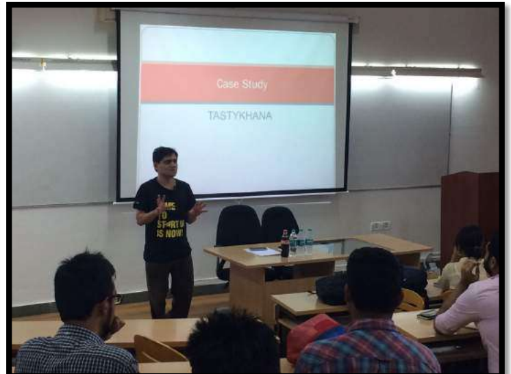
Chai with Entrepreneur