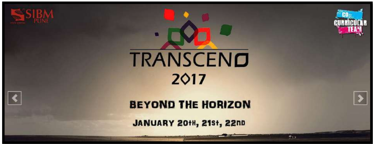
Transcend 2017 Official Website