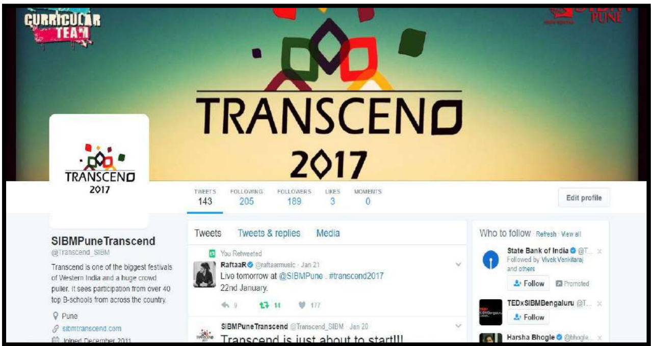
Transcend 2017 Twitter Page