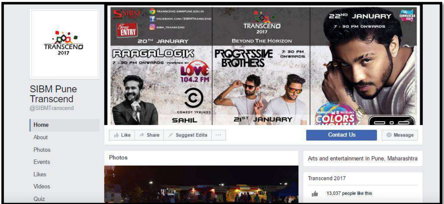
Transcend 2017 Facebook Page

Page likes increased for 7, 500 to - 13, 000 + in a span of 2 months