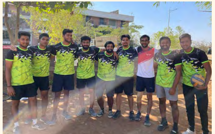
Official SIBM Volleyball Team