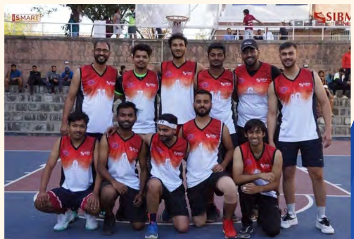
Official SIBM Basketball Team