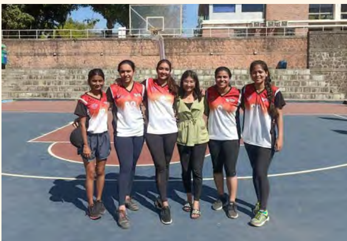
Official SIBM Basketball Team