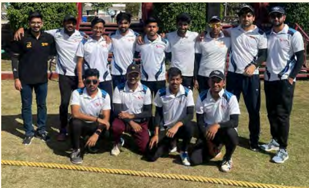
Official SIBM Cricket Team

The trials witnessed a display of raw talent, passion, and commitment as the students put their best foot forward to impress the selectors. The atmosphere was electric, with cheers and applause echoing throughout the campus as the players pushed themselves to the limit. The selection process was rigorous and only the most skilled and deserving candidates made it to the final cut who represented the official SIBM team at numerous B-school Sports Festivals.