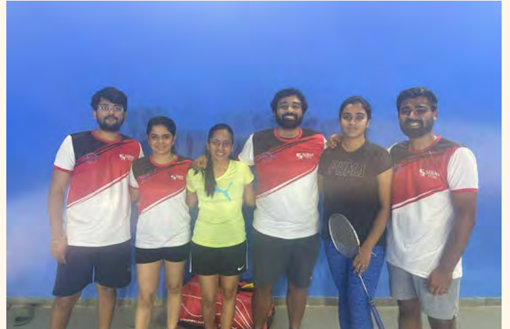
Official SIBM Badminton Team