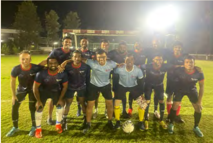
Official SIBM Football Team