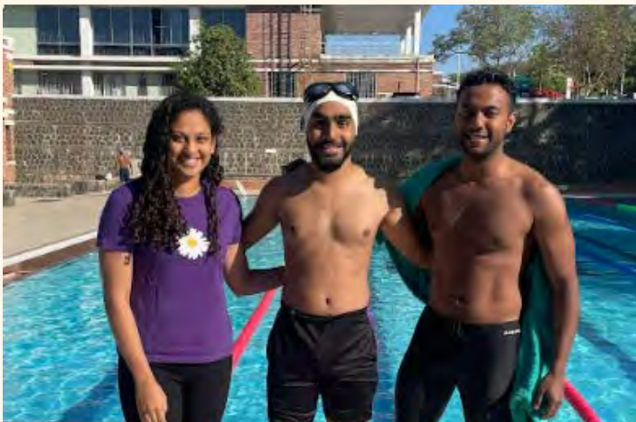
Official SIBM Swimming Team