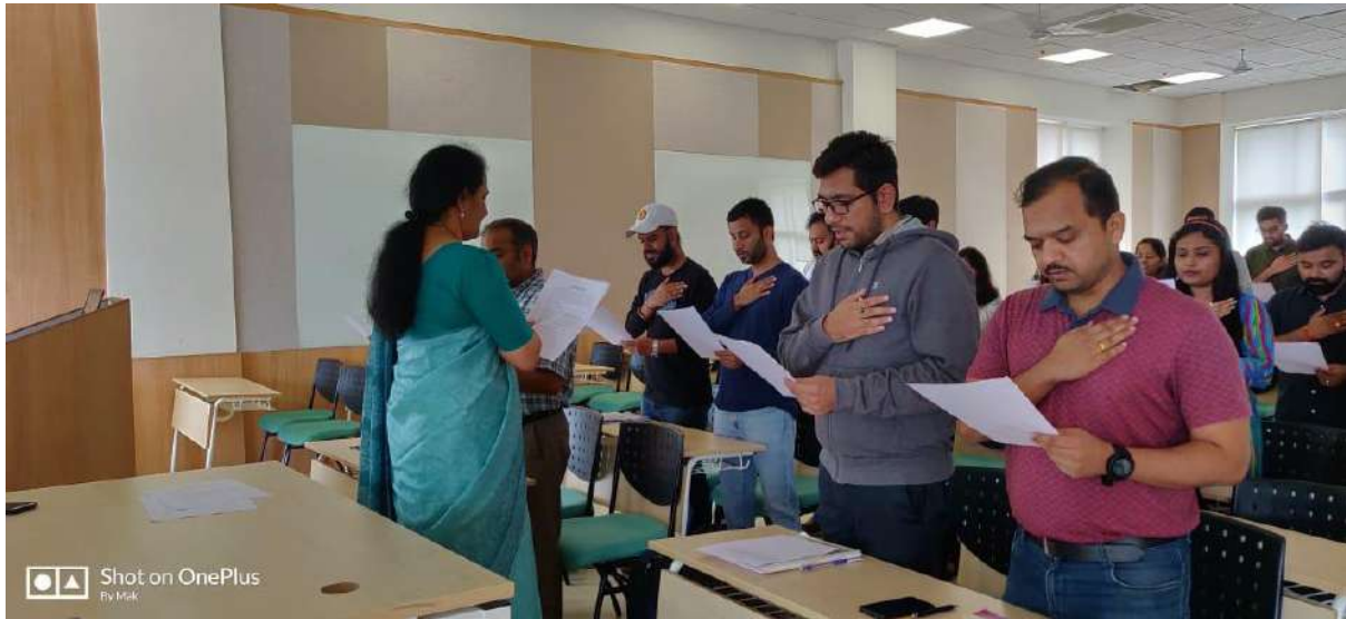
MBA Oath 2017-2018 Photo

This oath I make freely, and upon my honor.